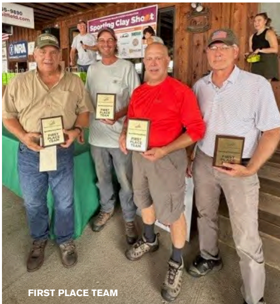
FIRST PLACE TEAM

Save the date for next year's shoot - Friday, August 1, 2025!