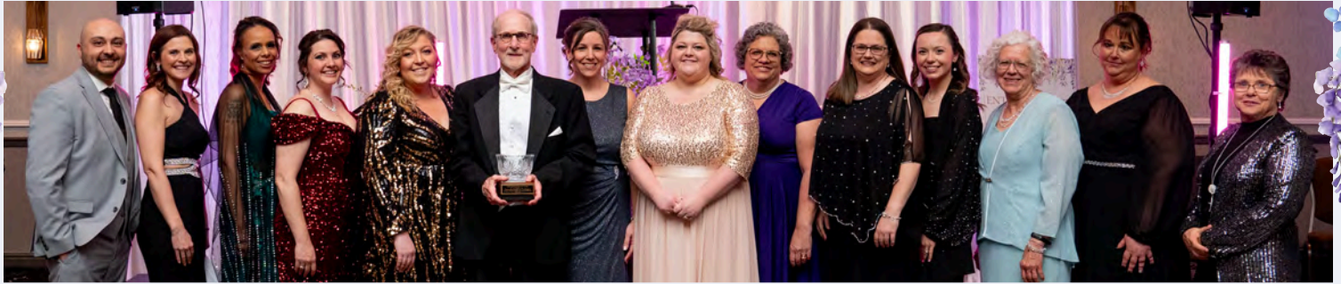
CONCORDIA HOSPICE OF WASHINGTON STAFF, WINNER OF THE 2024 DISTINGUISHED SERVICE AWARD

Thank you to our sponsors, committee members, and guests for making the 2024 Charity Ball another successful year! Together, over $130,000 was raised to support programs and services of UPMC Washington.