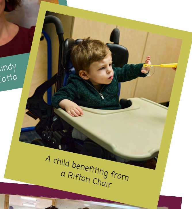
A child benefiting from a Rifton Chair

This grant has been used to purchase a Rifton Activity Chair, an innovative adaptive seating device that establishes safe seating and positioning for children with a variety of physical and or cognitive needs.