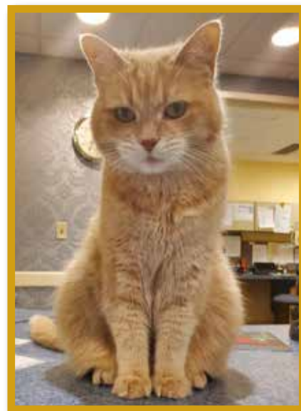
Flower enjoys all of the attention on the 3rd floor at The Heritage.

Thank you to everyone who contributed to this year's campaign. Your support helps keep our campus full of life, laughter and love—one paw, wing or tail at a time.