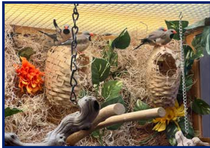
The birds in the newly refreshed aviary at The Ridgewood.