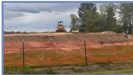
The view from Williamson Road as Horizon Construction builds up the base for the bridge supports.

Thank you to everyone whose generosity is helping make this project possible to improve safety, accessibility, and outdoor recreational opportunities on St. Paul's campus.