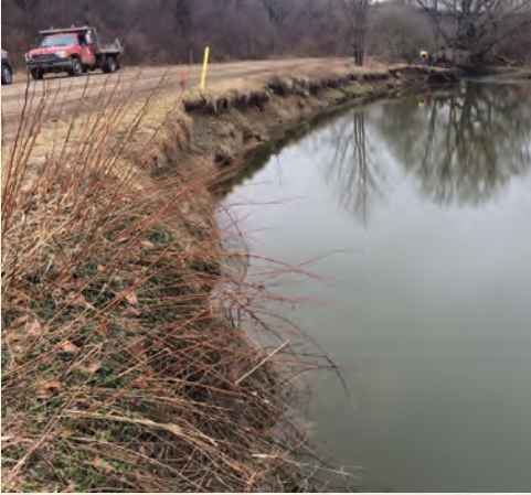
Creek Road Before