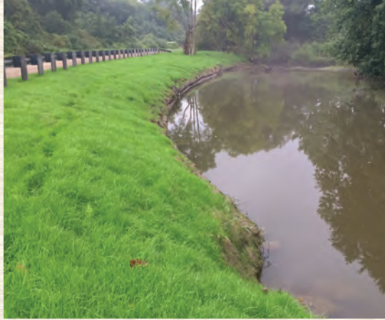
Creek Road After