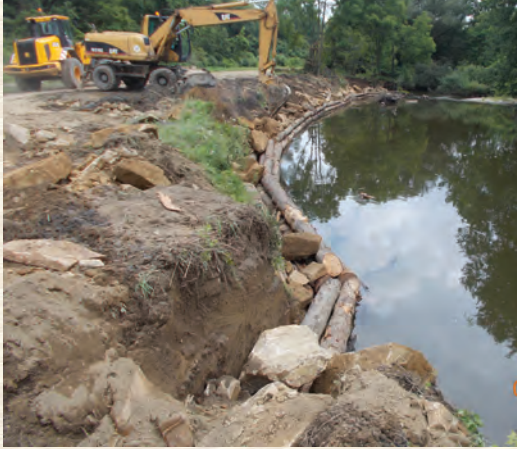
Creek Road During