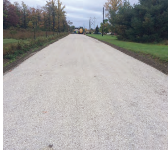
Storey Road After