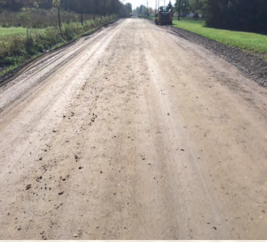
Storey Road Before