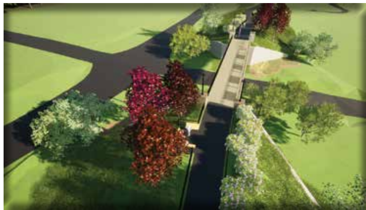
Artist rendering of an aerial view of the pedestrian bridge, which will be located near the intersection of Collins Drive and Killius Way.