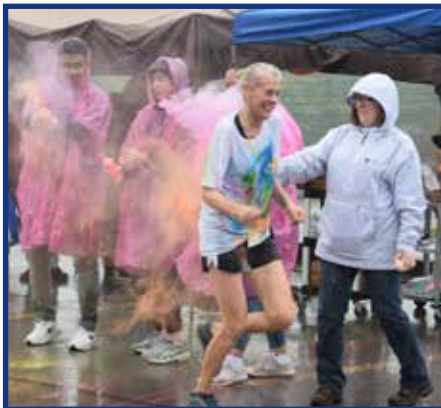
(Above left) PA students—in pink ponchos—doused runners with color as they neared the finish line during our annual Color Me Happy 5K race in May and (above right) enjoyed assisting residents during our annual Strawberry Festival in June.

The project offers clinical support for persons living with acquired neurological diseases such as dementia, Parkinson's disease and aphasia. Students meet with St. Paul's residents and those within the Greenville community in structured group sessions to facilitate