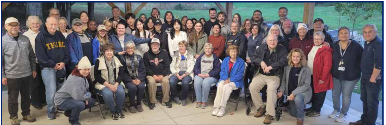
The year's Joining Generations picnic saw the biggest crowd ever with more than 50 people in attendance!