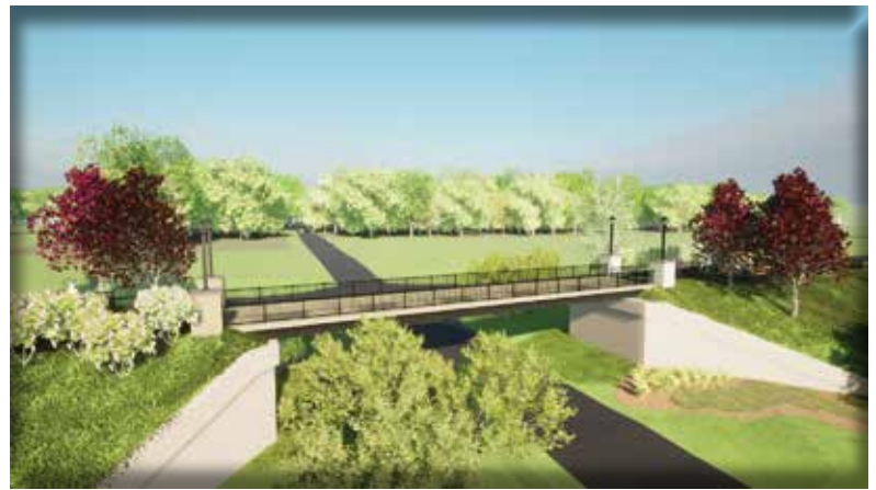
Artist rendering of the pedestrian bridge over Williamson Road.

A comprehensive 2022 PennDOT traffic study