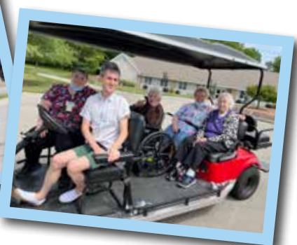
Residents and staff enjoying golf cart rides around campus last year.