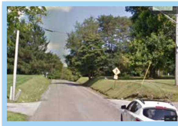
The intersection of Williamson Road and Oros Way is one of the most dangerous crossings on St. Paul's campus due to the limited visibility.