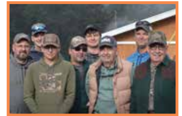
The Redfoot family who sponsored and participated.