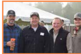
Sponsor Osborne-Williams Funeral Home's team of shooters.