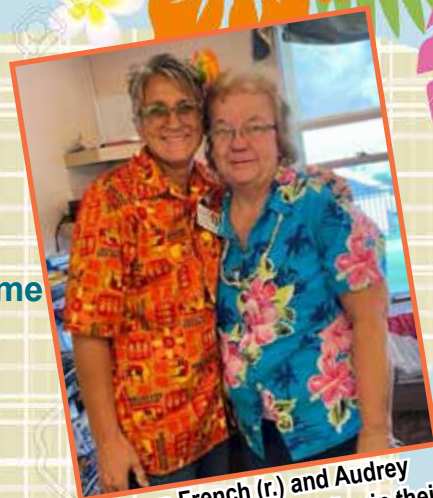
Dawn French (r.) and Audrey Bates looked super-festive in their colorful Hawaiian shirts!