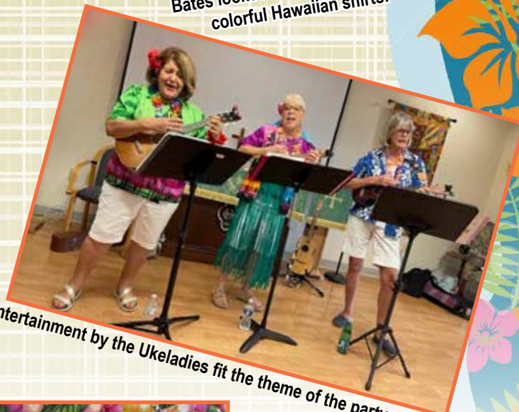
Entertainment by the Ukeladies fit the theme of the party perfectly!