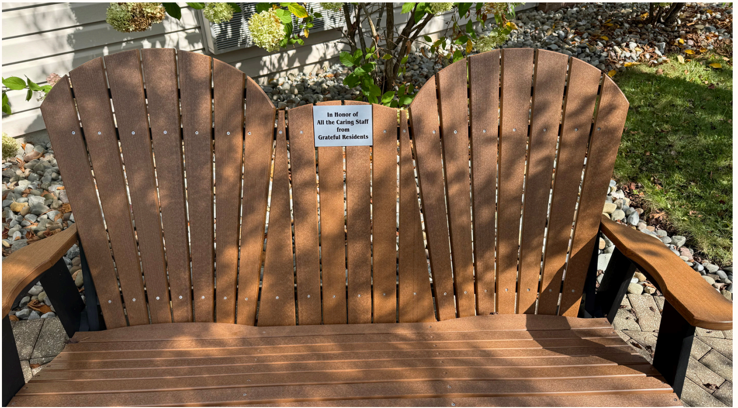
A look at the revitalized Ridgewood courtyard featuring new Amish furniture, fresh rock bedding, and a tranquil water feature made possible by our generous donors. It now offers residents a beautiful space to relax and gather.