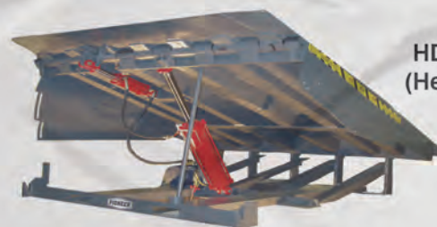
HDH Series (Heavy Duty)

Providing more than 35 years of customer satisfaction.