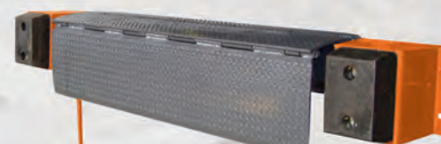
BL Series (Torsion Spring)

"Safe. Dependable PIONEER products put safety first, providing maintenance struts as a standard feature on ALL Pit Levelers."