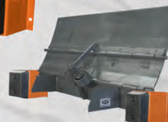
EDE Series (Extension Spring)