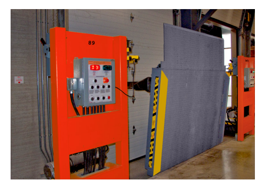
Pentalift Vertical Storing Dock Levelers

Pentalift offers hydraulically operated vertical storing dock levelers when safety, cleanliness, security, and energy savings are required in one design. This style of leveler is ideally suited for cold storage, food processing and pharmaceutical operations. Featuring a powered up and down hydraulic system which stores in a safe, over centered position. Use the following link to go to the dock leveler page on the internet. www.pentalift.com/dock-levelers.htm