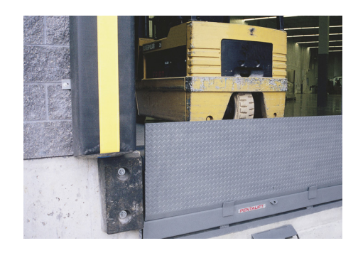
Pentalift Roll-Off Stop Lip Design