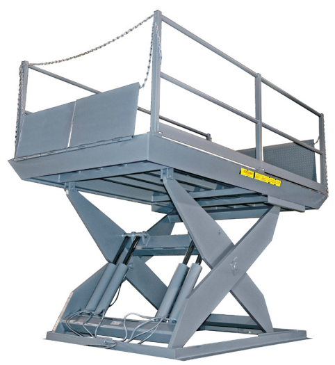
HED Series Pit Mounted Dock Lift

Dock lifts are an excellent means of simplifying loading functions and creating safer working conditions where loading docks don't exist or in conjunction with dock levelers to provide greater flexibility for a busy loading dock. Pentalift pitmounted and low-profile surface mounted dock lifts provide an increased service range eliminating the potential for unsafe loading operations due to severe height differences between ground level and the truck's trailer bed. Safer and more efficient than loading by ramp or by hand. Use the following link to go to the dock lift page on the internet.<u>www.pentalift.com/</u> elevating-docks.htm