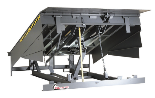
Pentalift Mechanical Dock Levelers