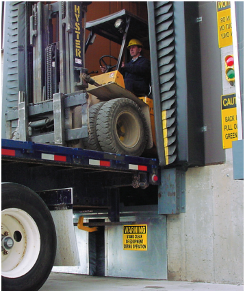
RVR32 Vehicle Restraint System