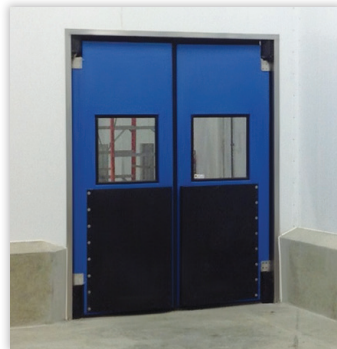
Durulite® Industrial Traffic Doors