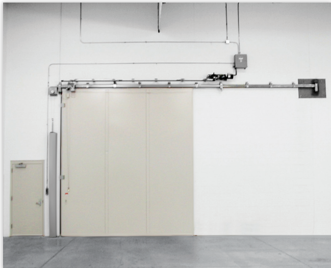
Saino Model 1000 with 1900 operator with explosion proof motor & intrinsically control mounted in NEMA-12 Control Box.

Saino Model 1000 and 2000 are designed for use in applications requiring economy in a manual fire door. They are custom manufactured and available in single slide or center parting with UL and FM label ratings of 20 minutes to 4 hours. Standard features include automatic close system with thermal heat detectors, stainless steel pull handles and low maintenance, heavy-duty hardware. These rugged doors are easy to install and maintain, ensuring years of worry free service.