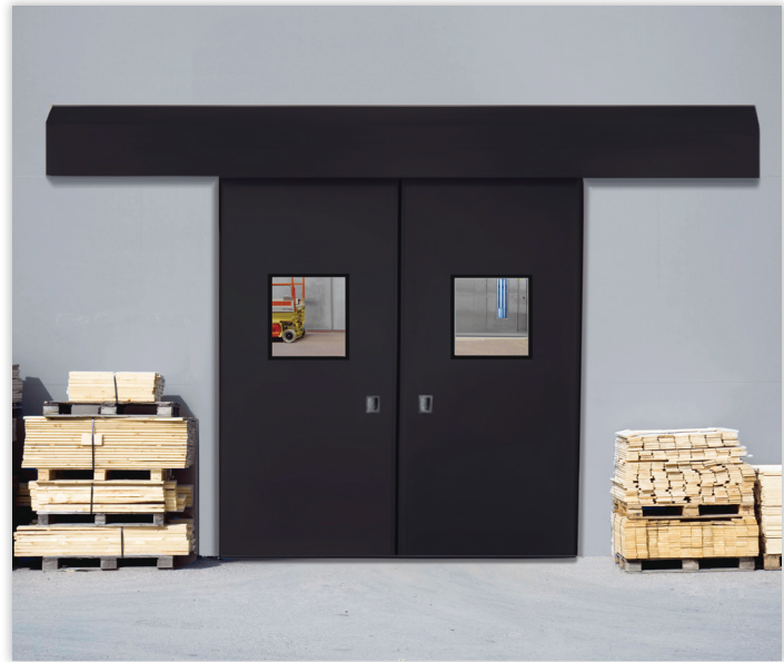
Saino Model 61000 shown with standard vision panels.

Saino 61000 casing mounted sliding service doors are an excellent choice for applications with high usage and where appearance is important. These attractive doors provide a clean appearance and ensures a positive seal when the door is closed. The panels are constructed with 20 gauge cold rolled face sheets bonded to Kraft honeycomb core (optional urethane core) and 18 gauge interior channels. Available in single slide and center parting configurations. Doors ship prime painted with a high quality gray rust resistant paint. The 61000 door system operates on the TX-1 operator, which is designed to provide years of smooth, trouble-free service. The TX-1 operator requires the least head room of any industrial door system available. Pre-mounted components minimize field assembly time and reduce the possibility of installation errors.