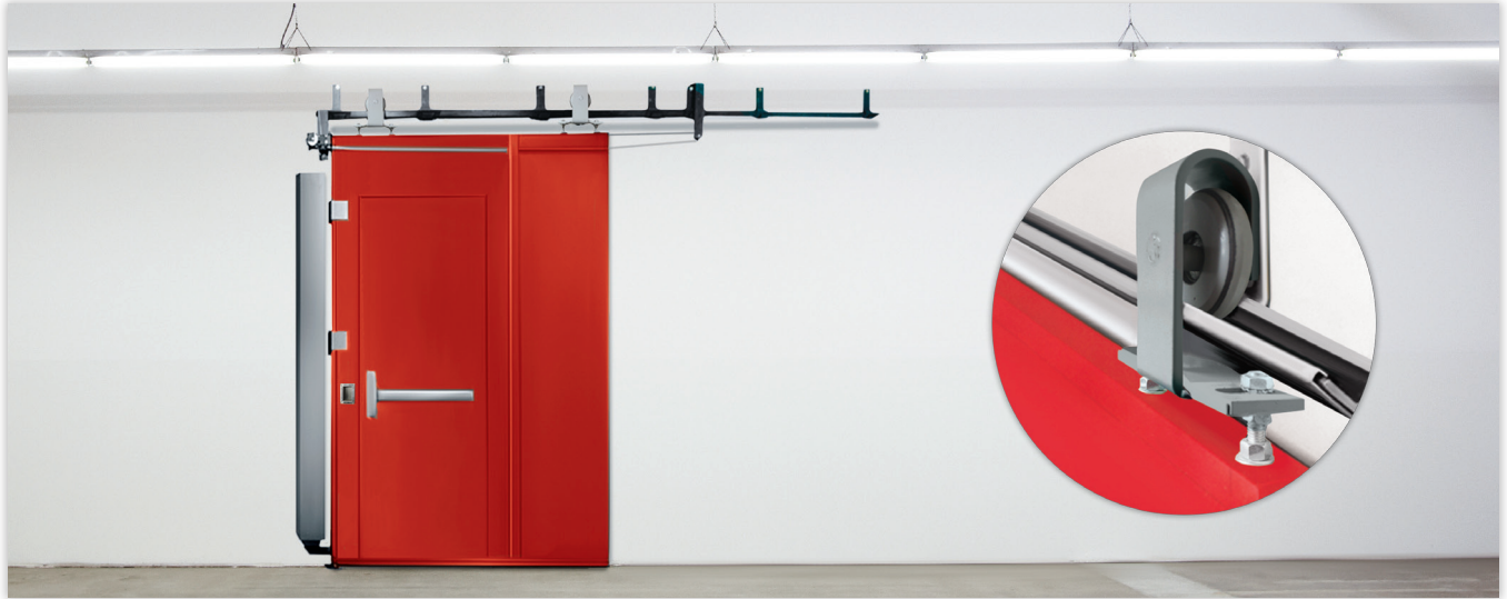
Saino Model 3000 with optional pass door.

Saino Model 3000 and 4000 are designed for high usage applications. Both models are custom manufactured and available in single slide or center parting with UL and FM label ratings of 20 minutes to 4 hours. Standard features include automatic close system with thermal heat detectors and Easy Roll hardware system.