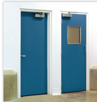
Durulite® CR-1400 Roto-Molded Doors