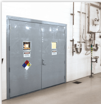
Fib-R-Dor® Fiberglass Door Systems