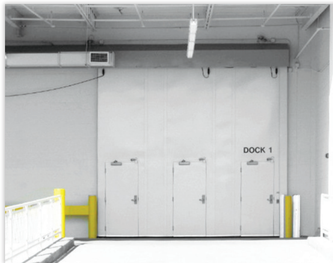
Saino Model 2000 shown with optional F1900 Operator & Pass Doors.