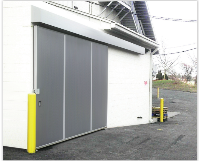
Saino Model 3100 shown with optional track hood.