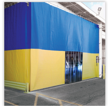
DuraSpan™ Industrial Curtains