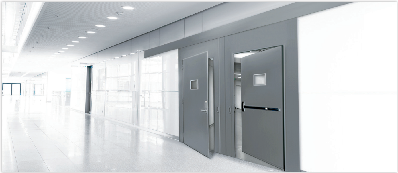
Saino Model 50000 shown with optional pass doors and windows.

Saino 50000 casing mounted fire doors are an excellent choice for applications with high usage and where appearance is important. The casing mounted design provides adequate spacing on both sides of the panel to install surface-mounted hardware for handicap access while allowing a portion of the weight of the door to be transferred to the floor. Standard features include a 20 minute to a 4 hour rating, low headroom track system, concealed binders, full perimeter gasketing and a track hood.