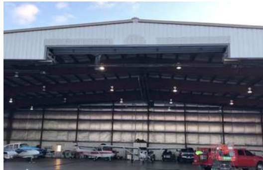
Vertical lift tail door open.