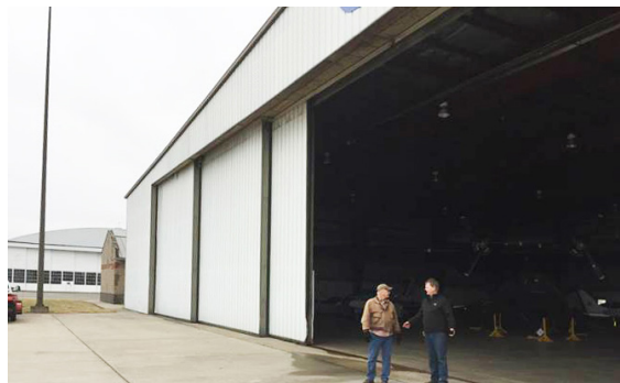
Exterior shot of existing hangar door.