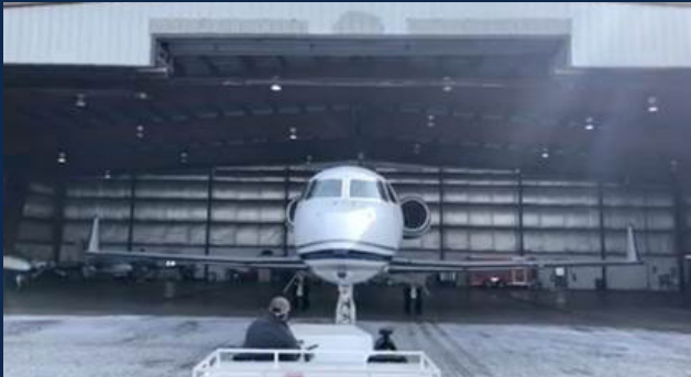
Backing in the new G IV aircraft.