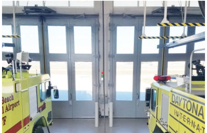
Daytona Beach International Airport.

Interior Folding XT - Exterior Folding: Saves Interior Bay Space Hurricane Rated: Up to 120psf and Level E Impact Tested - Interior or Exterior Folding