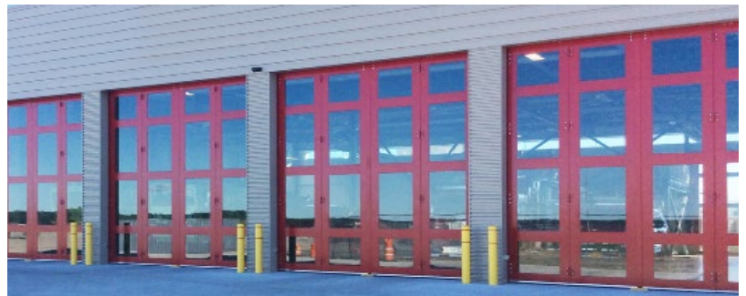
ARFF Exterior View of DE Four-Fold Doors.