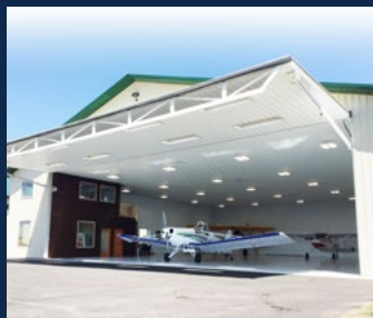
HD HYDRAULIC DOOR SYSTEMS