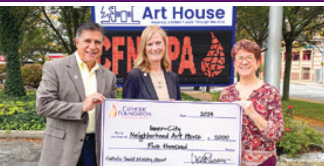
Neighborhood Art House, Erie