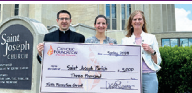
Saint Joseph Parish, Sharon