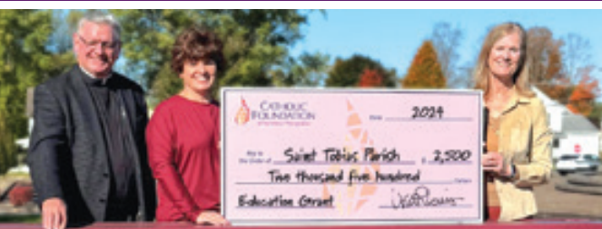
Saint Tobias Parish, Brockway