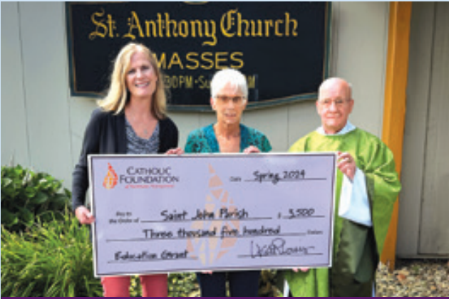
Saint John Parish, Tidioute