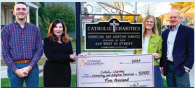
Catholic Charities Counseling & Adoption Services, Erie