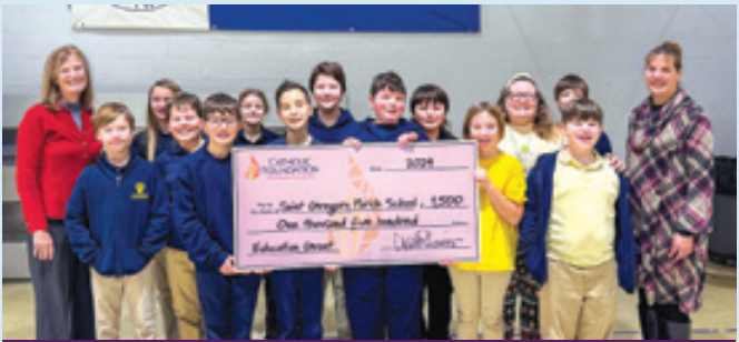
Saint Gregory Parish School, North East