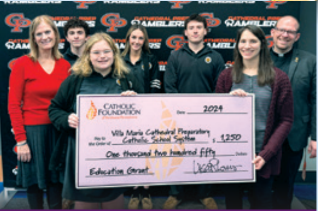
Villa Maria Cathedral Preparatory School, Erie