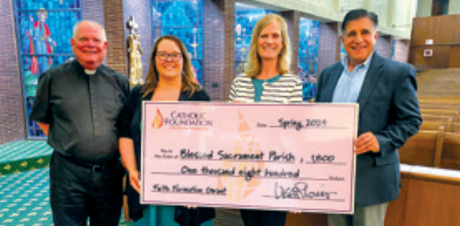
Blessed Sacrament Parish, Erie