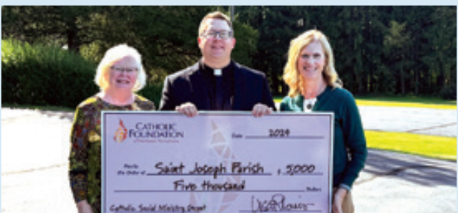
Saint Joseph Parish, Lucinda; Saint Michael Parish, Fryburg; and Saint Mary Parish, Crown