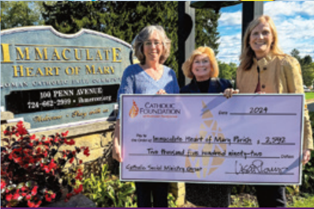
Immaculate Heart of Mary Parish, Mercer