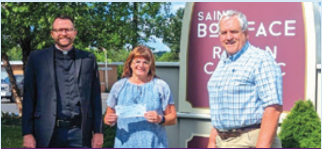
Saint Boniface Parish, Kersey