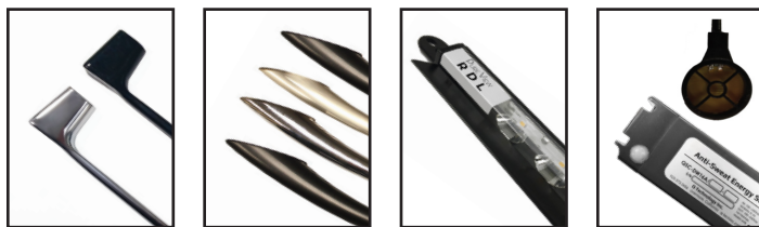
Slimline Handles Elliptical Handles LED Lighting Energy Controller

NOTE: Full Length Handles (not shown), are also an available option.