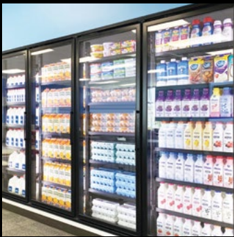
1400 NARROW RAIL DOOR SYSTEMS