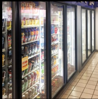
1400 FLAT RAIL DOOR SYSTEMS