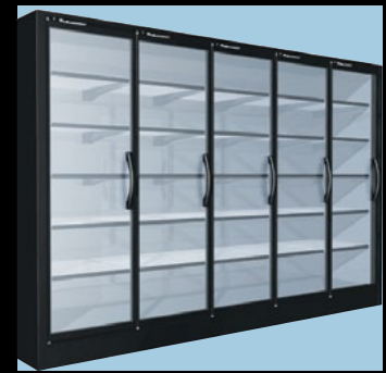
WELDED PVC DOOR SYSTEMS