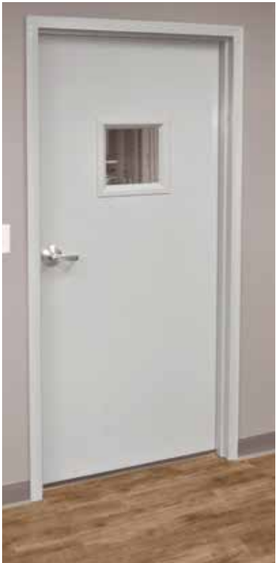
Tiger Fiberglass Door shown in corridor application.

TRAFFIC: Pedestrian APPLICATIONS: Restaurant, Retail & Supermarket, Pharmaceutical, Food Processing, Industrial, Clean Room, Corrosive DOOR BODY: In-Mold 25-30 mil gelcoat with Urethane Topcoat Finish supported by a muscular bi-axial glass fiber structural reinforcement layer. Resin Impregnated Honeycomb core is standard. AVAILABLE OPTIONS: Window Options, Lite Kit Options, Polypropylene Honeycomb Core, Gypsum Mineral Core, Polyisocyanurate Foam Core, Thresholds, Door Sweeps, Door Louvers, Weatherstrips and Gaskets, Astragals, Frame Options