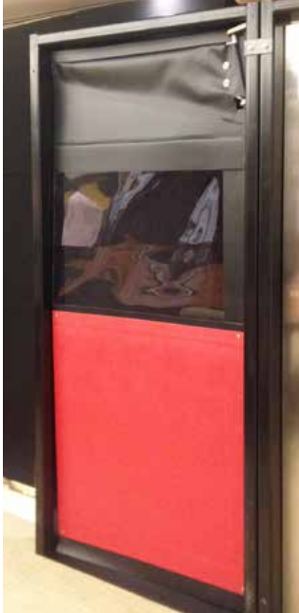
AirGard 973 Single Panel shown above.

TRAFFIC: Pedestrian, Push Cart, Pallet Jack, Forklift APPLICATIONS: Industrial & Commercial, Retail & Supermarket, Cooler* DOOR BODY: Constructed with a .160" thick PVC door body and a two-ply vinyl coated nylon bracket pocket. 3" overlap at the center on bi-parting doors provides a noise and temperature barrier. 48" high USDA accepted textured vinyl impact plates (both sides). WINDOW: Extra large viewing area HINGE: Top Mounted Gravity Hinge AVAILABLE OPTIONS: Window Options, Impact / Kick Plates, Hinge & Color Options *only to be used as a secondary door in cold storage applications.