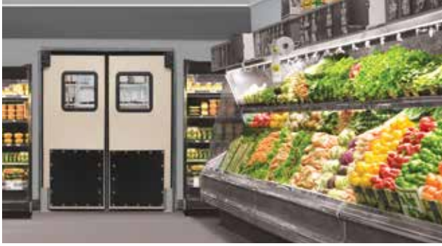
SUPERMARKETS / GROCERY STORES