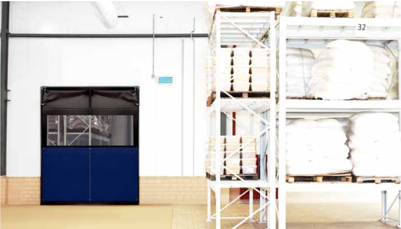
Chase Doors AirGard 973 shown in stock room application.