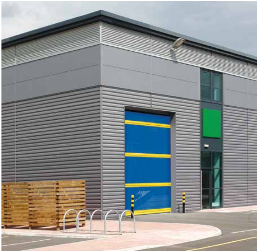
TMI Bug Screen Roll-Up Door shown in loading dock application.

TRAFFIC: Pedestrian, Push Cart, Pallet Jack, Forklift APPLICATIONS: Kitchen & Restaurant, Retail & Supermarket, Industrial & Commercial, Cooler & Freezer DOOR BODY: Strip PVC material of choice, various bracket choices available. BRACKET OPTIONS: Threaded Stud variations, TMI Loc variations, Standard and Heavy Duty Overhead MATERIAL OPTIONS: Standard Clear PVC, Low Temp, Reinforced, Extra Low Temp, Offset Double Ribbed variations, Opaque Black and White, Anti-Static, Weld Screen and Safety Orange.