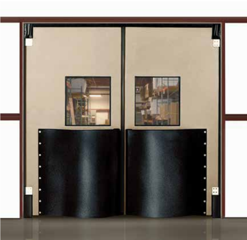
Durulite Industrial shown in warehouse / industrial setting.

TRAFFIC: Pedestrian, Push Cart, Pallet Jack, Forklift APPLICATIONS: Retail & Supermarket, Industrial & Commercial, Cooler & Freezer*, Washdown DOOR BODY: 1-7/8" Overall thickness, 1/4" thick rotationally molded polyethylene skin retains properties to -40°F, leading & back edge internal reinforcement & gasket WINDOW: 1/8" polycarbonate, black frame. HINGE: V-Cam Hinge System AVAILABLE OPTIONS: 180° x 90° Hardware, Teardrop Bumpers, Impact / Kick Plates, Lower Hinge Guards, Spring Assist, Locking Devices, Window Options OTHER: NSF Certified *only to be used as a secondary door in freezer applications.