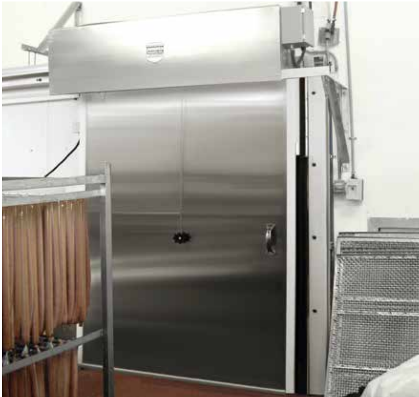
Enershield Air Barrier shown in Cold Storage Cooler Application.

TRAFFIC: Pedestrian, Push Cart, Pallet Jack, Forklift APPLICATIONS: Industrial & Commercial, Cold Storage, Distribution, Shipping & Receiving, Service Bays, Retail & Supermarket CONSTRUCTION: Galvanized steel exterior with finish painted components, control panel for automatic activation upon door opening is included. Lengths vary from 4' to 45'. Standard voltage varies per unit type. OTHER: Enhanced UL Certification Mark, US - CA AVAILABLE OPTIONS: Various Lengths available, Various Voltages, Vertical and Horizontal Mounting Options.