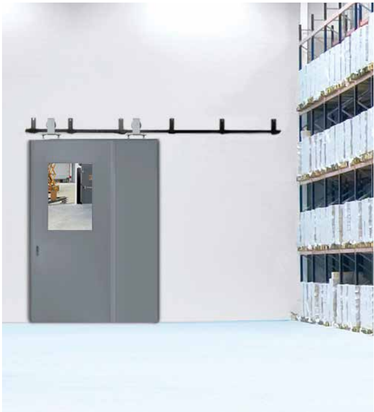
Saino 3100 shown in an interior warehouse application.

TRAFFIC: Pedestrian, Push Cart, Pallet Jack, Forklift APPLICATIONS: Retail & Supermarket, Industrial & Commercial DOOR BODY: Modular panel construction with Kraft honeycomb core, bonded to 20 gauge cold rolled face sheets and 18 gauge interior framing channels. Panels over 52" wide are connected with surface applied splice plates. Panels assembled with heavy-duty 14 gauge capping channel and 10 gauge bottom guide roller channel. Prime painted with rust resistant paint. Equipped with Easy Roll Hardware System. Consists of 2" x 2" x 3/8" angle track, heavy-duty hangers with 3/8" x 3-1/2" hanger frames, 5-1/4" diameter wheels and precision ball bearings. Track door can be motorized without additional track hardware. OTHER: All Sliding Fire Doors are UL Listed & Labeled. AVAILABLE OPTIONS: Optional Galvanized prime painted or stainless steel finishes, Control Speed Closing option, Single Slide or Center Parting.