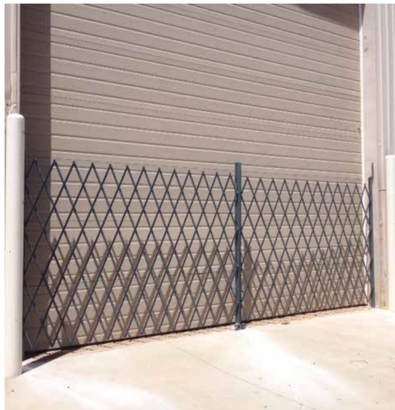
TMI Save-T® Security Gate in garage application.

OVERVIEW: Made of heavy-duty 7 gauge steel, they absorb impact from forklifts and other vehicles. Track guards bolt to the floor and the wall for firm attachment. Wraps around door track without interfering with door operation. 45 degree angle flange, 1/4" thick floor plate drilled for (3) 1/2" anchors, 3/16" thick wall flange drilled for (3) 1/2" anchors, 7-1/4" projection. Stocked in 36" (DTC 36) and 48" (DTC 48) sections.