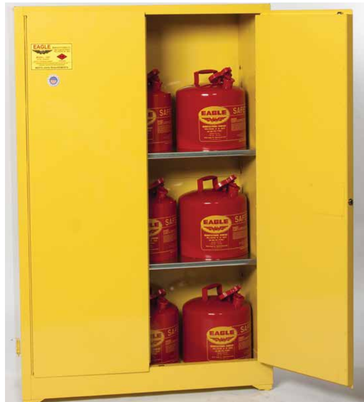
TMI Save-T® Storage Cabinet shown in a larger size.

OVERVIEW: Made of 18 gauge steel and are designed to protect contained flammable liquids for a period of 10 minutes, giving employees times to exit a building in case of a fire. Each cabinet has adjustable shelves to accommodate various container sizes. Meet NFPA Code 30 and OSHA specifications.