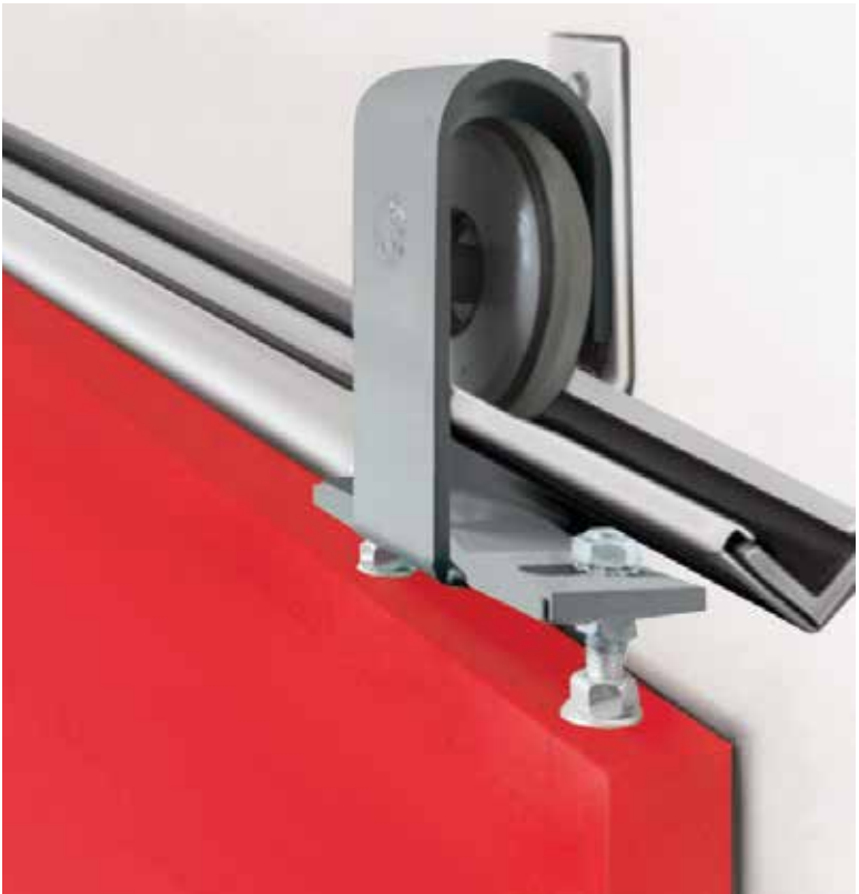
Saino Easy Roll Hardware System.