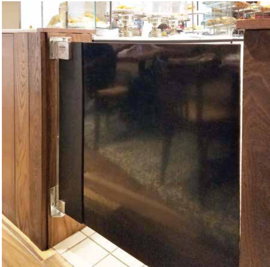
PMP Gate / Cafe shown in a dining / counter application.