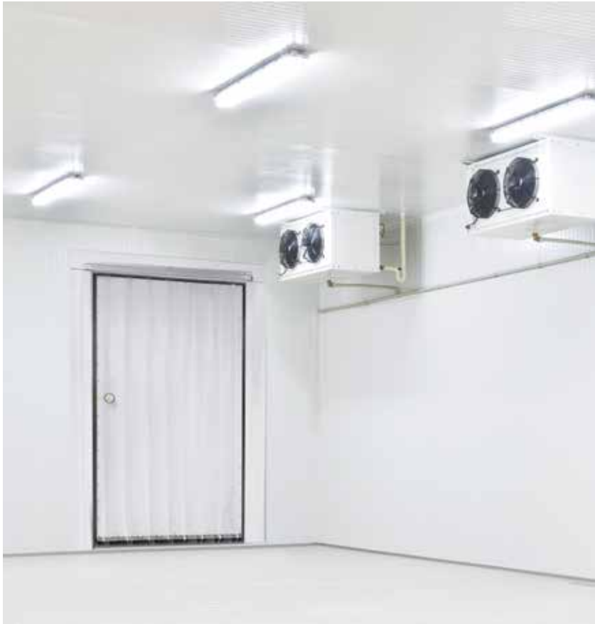
Strip Door shown in a walk-in freezer application.