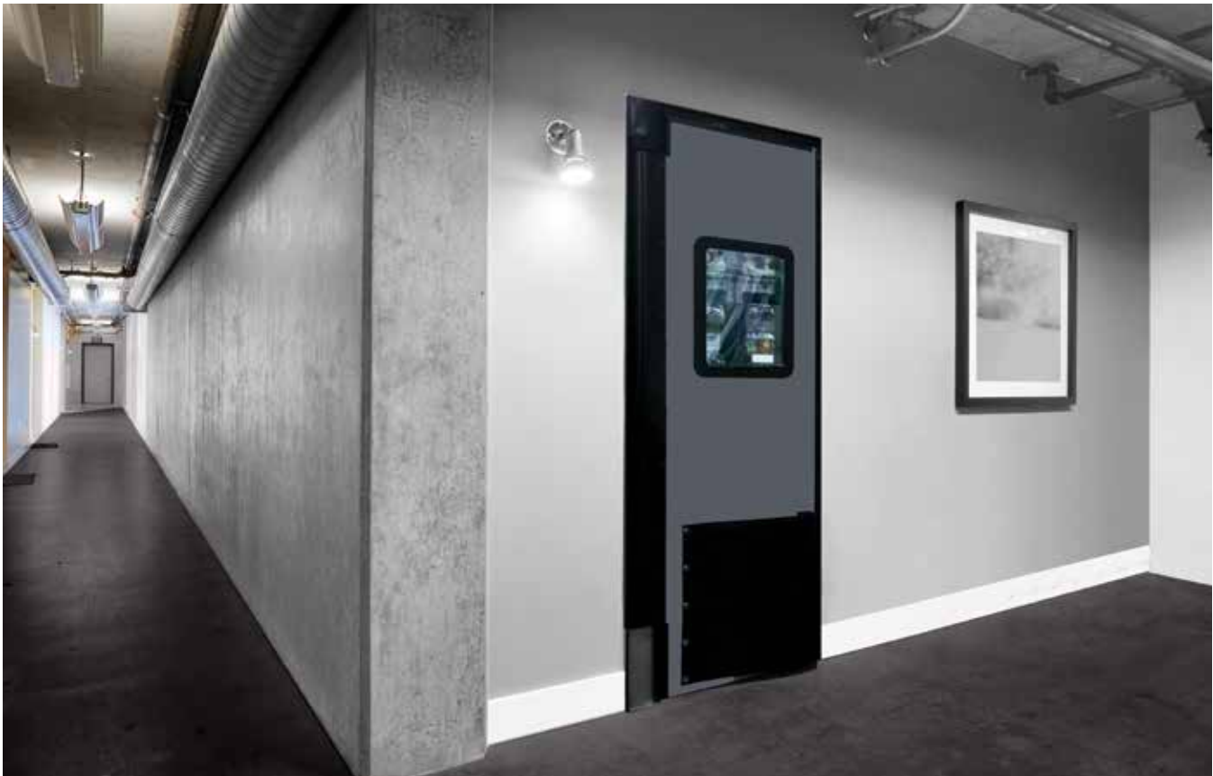
Durulite Retailer R25D shown in a back storage application.