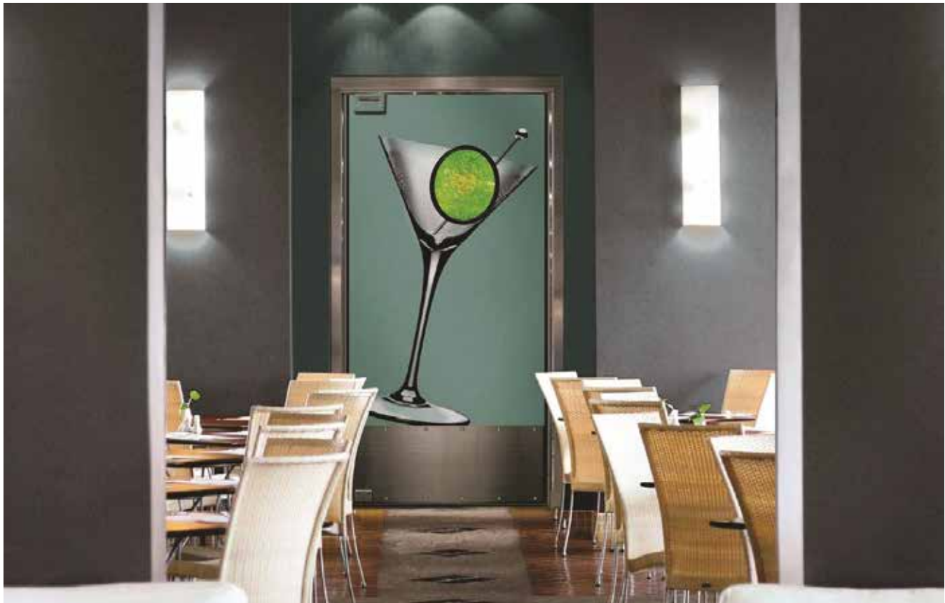
SCP Series shown in a dining to kitchen application with graphic door option.