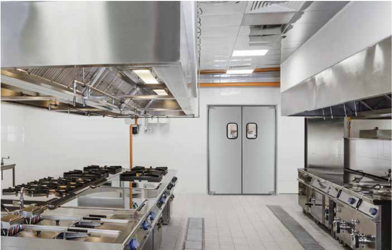
LWP Series shown in a kitchen application.

TRAFFIC: Pedestrian, Push Cart, Pallet Jack APPLICATIONS: Kitchen & Restaurant, Retail & Supermarket DOOR BODY: .063" thick tempered aluminum alloy with delta formed vertical edges, anodized aluminum finish. WINDOW: 9" x 14" clear acrylic set in black rubber molding HINGE: Eliason Easy Swing® Hinge AVAILABLE OPTIONS: Various window options, 12" high stainless steel base plate (both sides), .032" decorative high-pressure laminate (both sides).