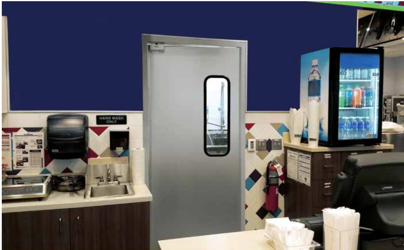
Eliason LWP-3 shown in a counter / kitchen application.