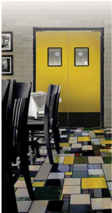
Eliason SCP-15 shown in a dining application.

TRAFFIC: Pedestrian & Push Cart APPLICATIONS: Kitchen & Restaurant, Retail & Supermarket DOOR BODY: .75" sustainable, moisture resistant, composite wood core, 1" total door thickness. WINDOW: 9" x 14" gasketed window, clear acrylic HINGE: Eliason Easy Swing® Hinge AVAILABLE OPTIONS: Window options, Impact / Kick Plates, .032" decorative high-pressure laminate (both sides), Full perimeter gasketing (specify SCG series), Graphic Door options available.