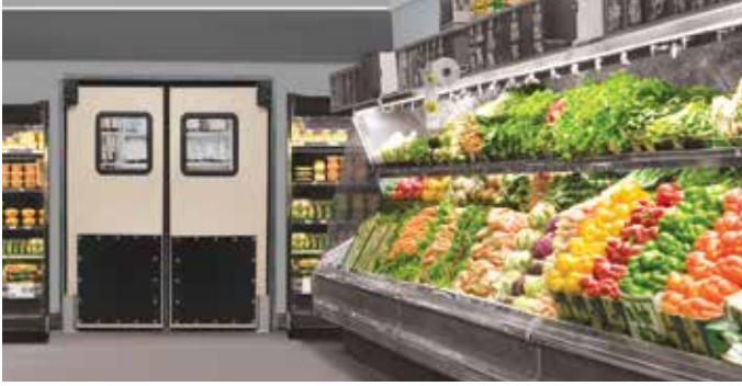
SUPERMARKETS / GROCERY STORES