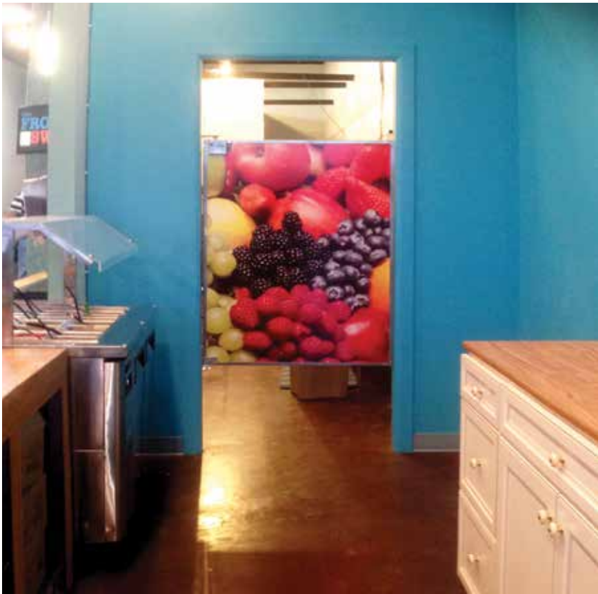
SCP Gate / Cafe shown in a restaurant application with a graphic door option added.

TRAFFIC: Pedestrian & Push Cart APPLICATIONS: Kitchen & Restaurant, Retail & Supermarket DOOR BODY: .75" sustainable, moisture resistant, composite wood core, 1" total door thickness. .032" decorative high-pressure laminate (both sides) EDGE TRIM: Black plastic molding HINGE: Eliason Easy Swing® Hinge AVAILABLE OPTIONS: Contour top and bottom, graphic door model option.