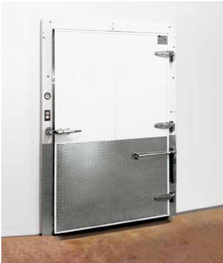
Chase ColdGuard Swinging Door shown in cold storage application.

TRAFFIC: Pedestrian APPLICATIONS: Kitchen & Restaurant, Retail & Supermarket, Food Processing, Institutional, Cold Storage, Industrial DOOR BODY: Thermally neutral fiberglass reinforced pultrusion (FRP) framework with CFC-Free foamed-in-place polyurethane core. Front casings are fiberglass reinforced pultrusions (FRP) with molded polymer plastic thru-wall and mirror image casings. Positive seal magnetic gasket is standard, along with self-lubricating cam lift hinges and standard cold storage latch. WINDOW: Vision panels available in non-heated (cooler) or heated (freezer) OTHER: Meets HR-6 Energy Independence and Security Act Requirements AVAILABLE OPTIONS: Various Cladding Options, Accessory and Hardware Options, 6" Door Thickness for Extreme Cold