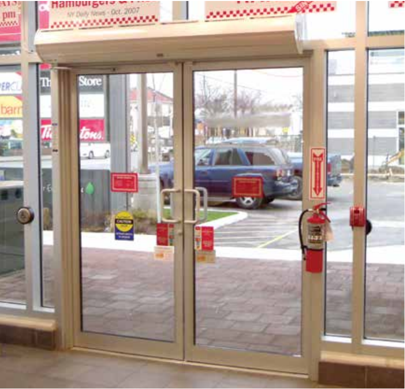
Horizontal Microshield Air Barrier shown in a restaurant application.

AVAILABLE OPTIONS: Color Options Available