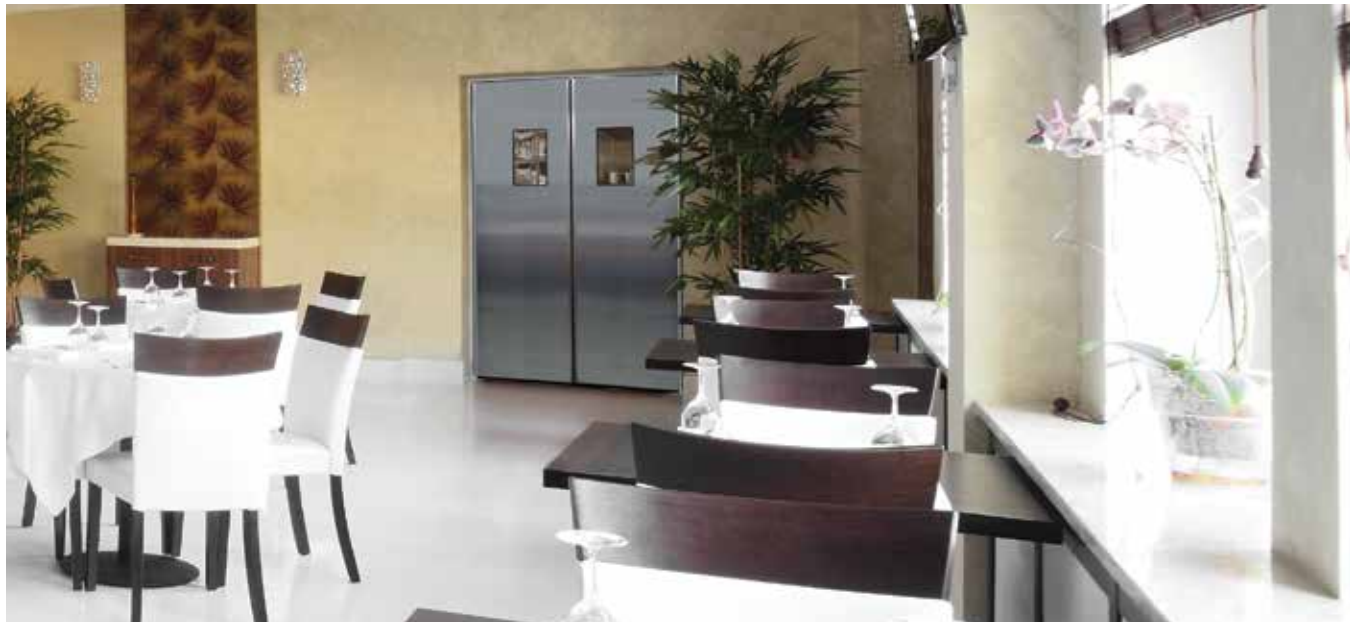
Eliason EHH-3 shown in a dining application.