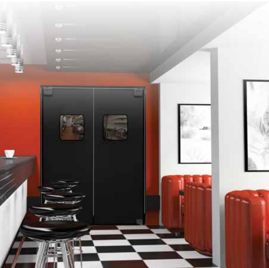
P-11 Plus shown in a dining application.

TRAFFIC: Pedestrian, Push Cart, Pallet Jack APPLICATIONS: Kitchen & Restaurant, Retail & Supermarket, Industrial & Commercial DOOR BODY: High strength polymer cell core with 1/2" PVC frame, 5/8" total door thickness, high impact thermoplastic exterior, galvanized powder coated satin black back spine WINDOW: 14" x 16" clear acrylic set in black rubber molding. HINGE: Eliason Easy Swing® Hinge AVAILABLE OPTIONS: 9" x 30" ADA-Compliant windows, stainless steel back spine