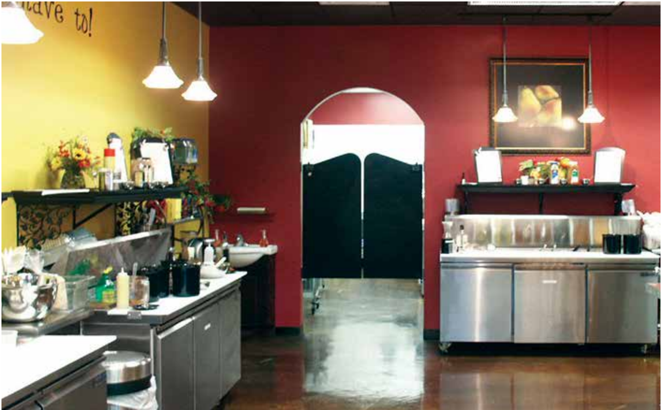
Eliason SCP Cafe Door shown with contour top in kitchen application.

TRAFFIC: Pedestrian, Push Cart, Pallet Jack APPLICATIONS: Kitchen & Restaurant, Retail & Supermarket, Industrial & Commercial, Cooler & Freezer DOOR BODY: 1/8" thick high-density rotationally molded polyethylene and Non-CFC urethane foam core. Replaceable perimeter edge gasketing, full height backspine. HINGE: V-Cam Hinge System AVAILABLE OPTIONS: Various Window Sizes, Impact / Kick Plates, Teardrop Bumpers, Cart Guards, Locking Devices, 180° x 90° Hardware, SlideTrac Bumpers™