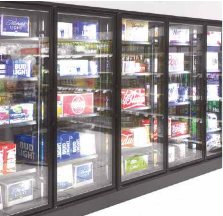
Thermoseal Glass Series line-up shown above.

TRAFFIC: Pedestrian APPLICATIONS: Retail & Supermarket, Cooler, Freezer DOOR BODY: Aluminum door frame, reversible door swing, 3 pane non-heated glass, automatic hold-open, hinge pin, torque and sag adjust, magnetic door gaskets, standard 27" deep shelving, energy controller and LED Lights AVAILABLE OPTIONS: Energy-free cooler door, french door frame (cooler only), full length handle, cylinder or POM lock, energy controller, extra shelves, black / white epoxy-coated shelf posts, narrow / wide rail, pass-thru door version