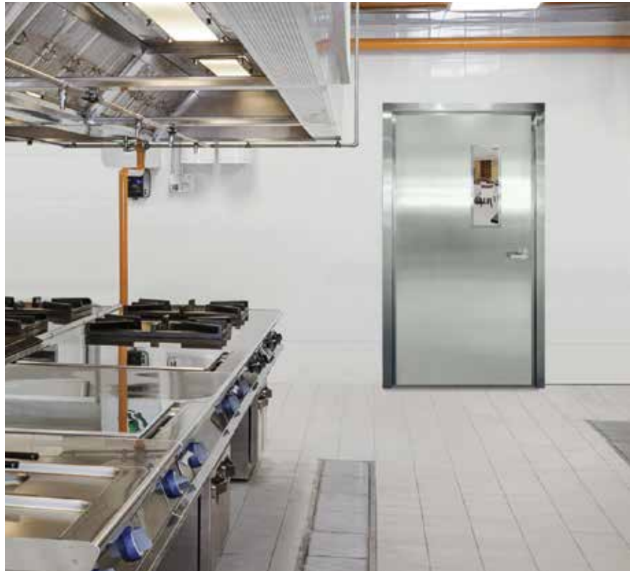
Eliason Stainless Steel Flush Door shown in kitchen application.

MATERIAL OPTIONS: Standard Clear PVC, Low Temp, Reinforced, Extra Low Temp, Offset Double Ribbed variations, Opaque Black and White, Anti-Static, Weld Screen and Safety Orange.