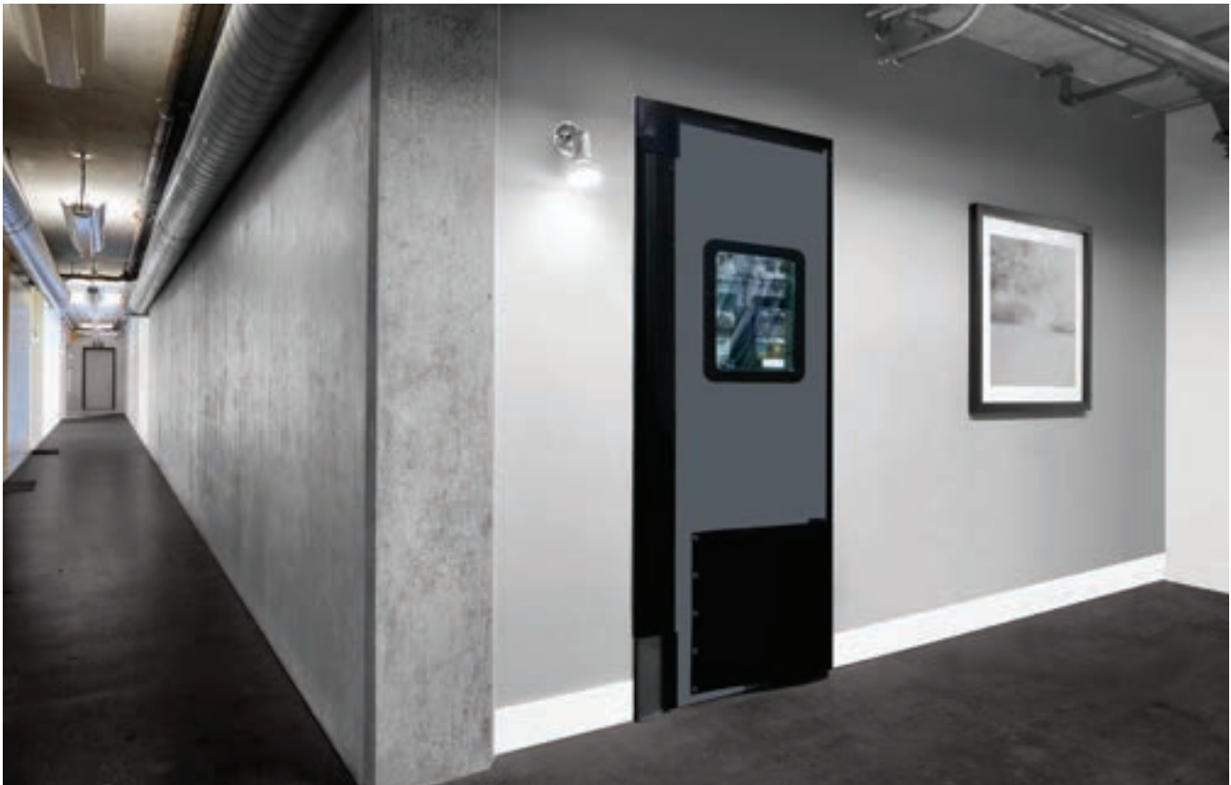
Durulite Retailer R25D shown in a back storage application.

AVAILABLE OPTIONS: Various Window Sizes, Impact / Kick Plates, Teardrop Bumpers, Cart Guards, Locking Devices, 180° x 90° Hardware, SlideTrac Bumpers™