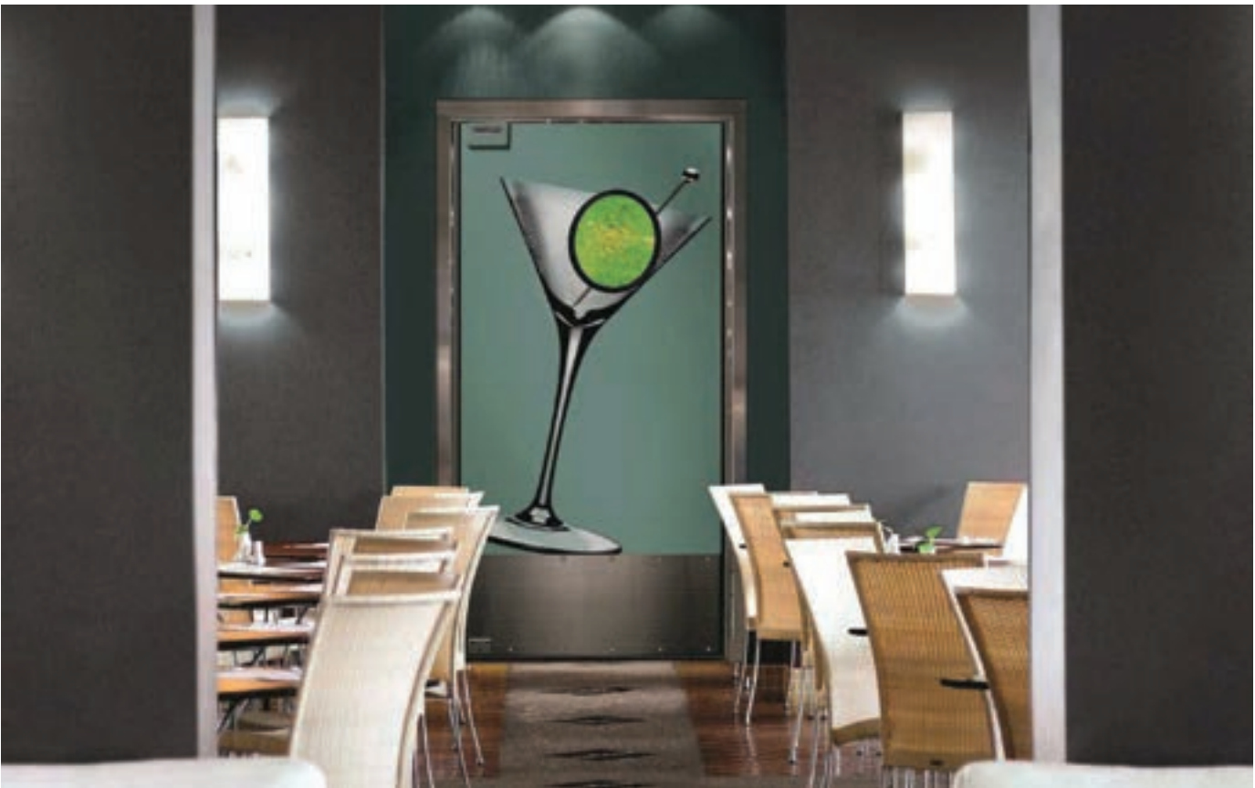
SCP Series shown in a dining to kitchen application with graphic door option.