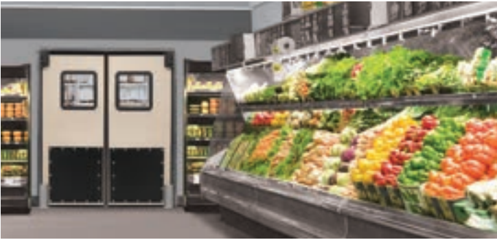
SUPERMARKETS / GROCERY STORES