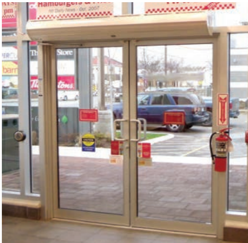
Horizontal Microshield Air Barrier shown in a restaurant application.

AVAILABLE OPTIONS: Color Options Available