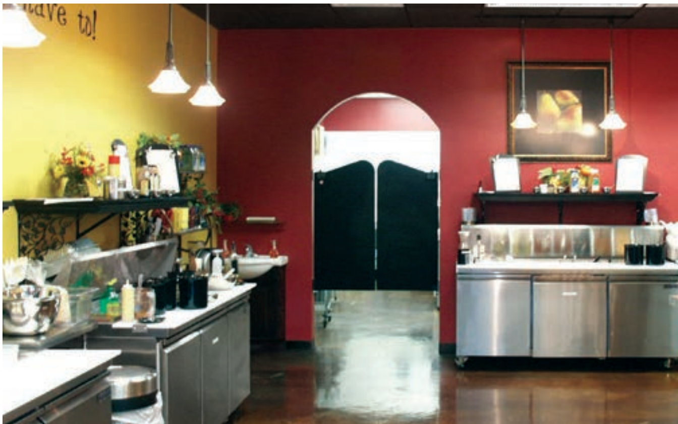
Eliason SCP Cafe Door shown with contour top in kitchen application.