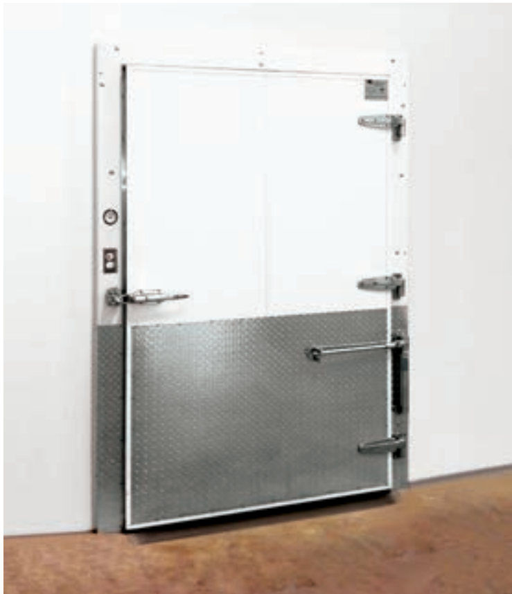
Chase ColdGuard Swinging Door shown in cold storage application.

AVAILABLE OPTIONS: Various Cladding Options, Accessory and Hardware Options, 6" Door Thickness for Extreme Cold