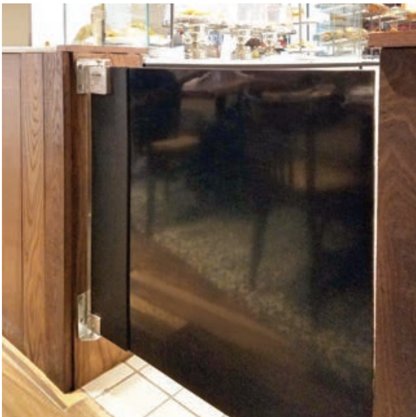
PMP Gate / Cafe shown in a dining / counter application.