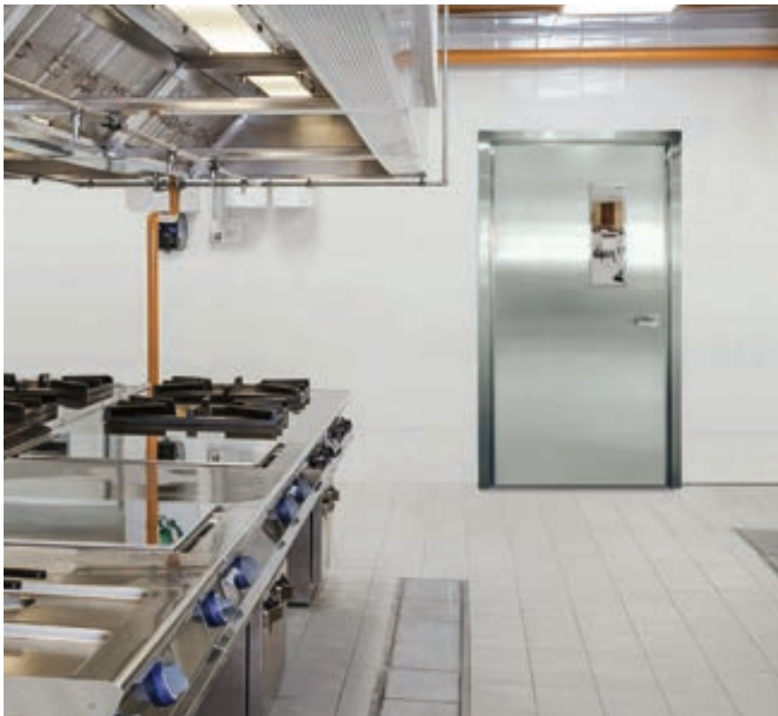
Eliason Stainless Steel Flush Door shown in kitchen application.