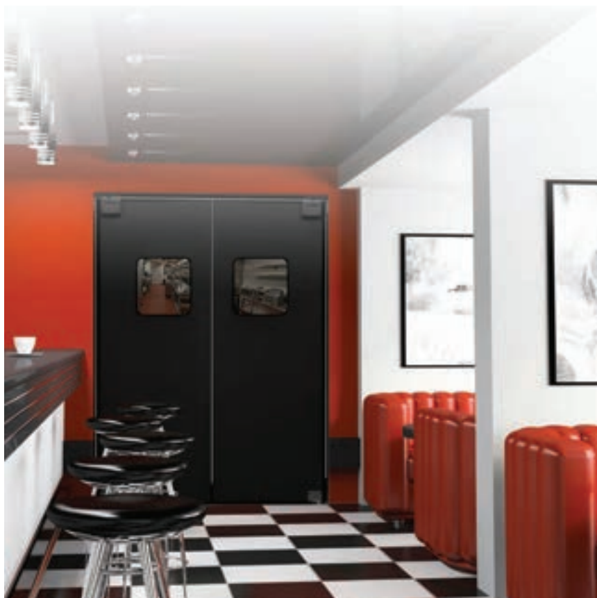
P-11 Plus shown in a dining application.

AVAILABLE OPTIONS: 9" x 30" ADA-Compliant windows, stainless steel back spine