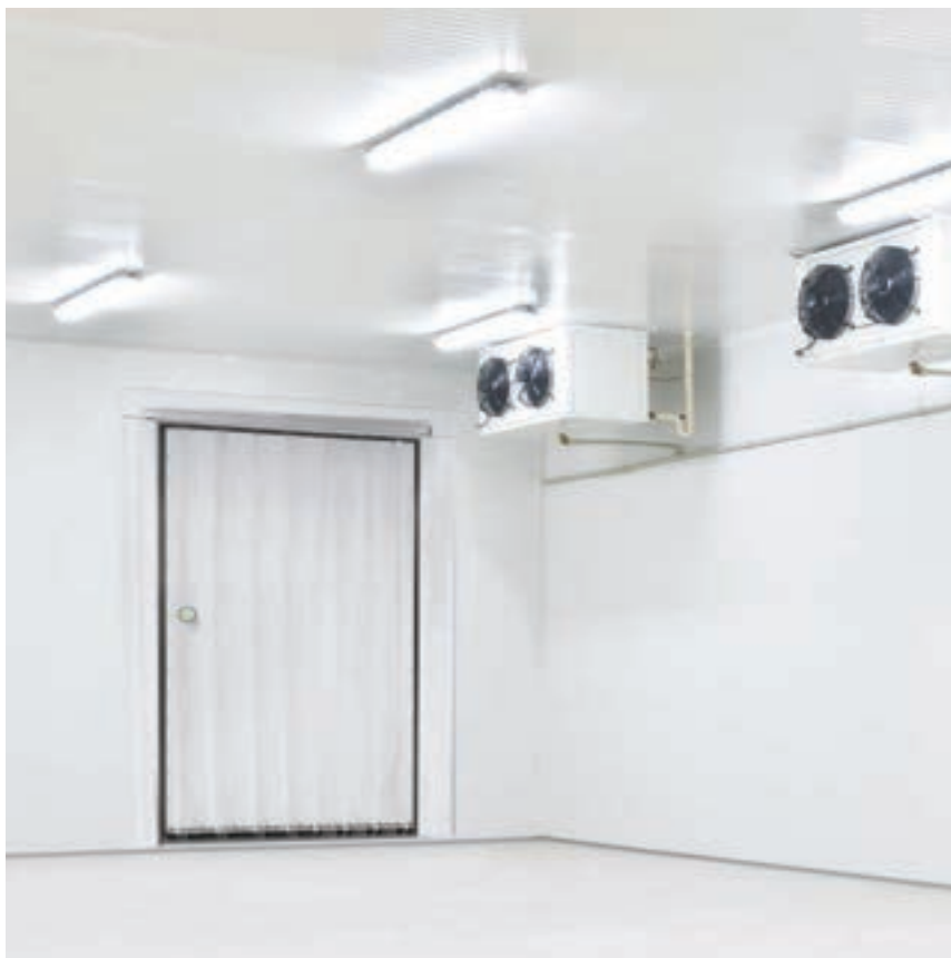
Strip Door shown in a walk-in freezer application.