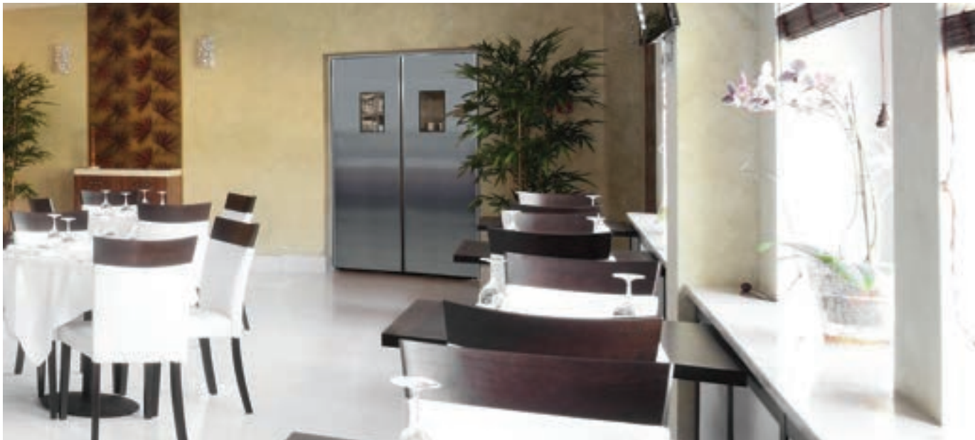
Eliason EHH-3 shown in a dining application.