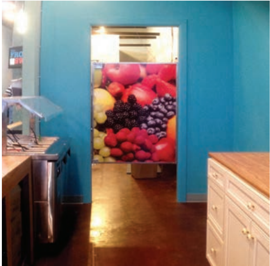
SCP Gate / Cafe shown in a restaurant application with a graphic door option added.

AVAILABLE OPTIONS: Contour top and bottom, graphic door model option.