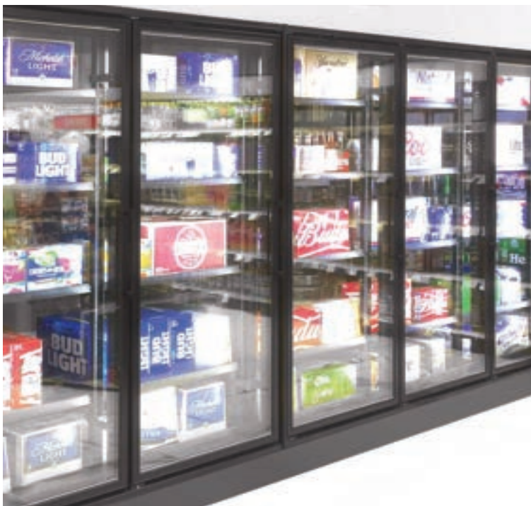
Thermoseal Glass Series line-up shown above.