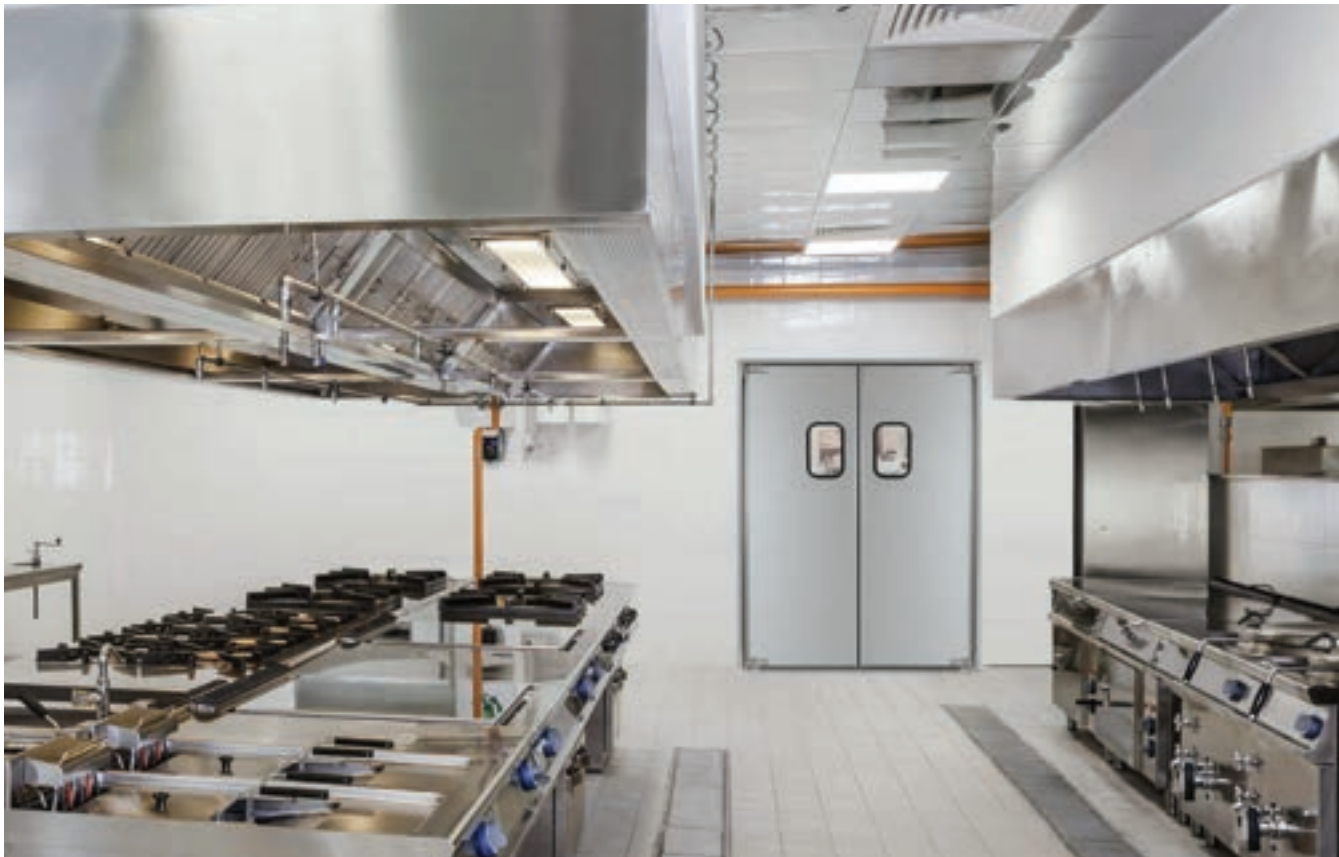
LWP Series shown in a kitchen application.